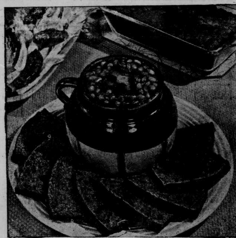
One mixing—one baking gives 2 loaves of Spicy Hot Brown Bread Baked Brown Bread

The young folks will relish this treat when it is their turn to have "the crowd." That's when you'll come in for compliments, for this fine, wholesome bread is ideal for hearty young appetites. Clip the recipe today!