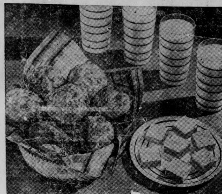
Follow Rules for Melt-in-Your-Mouth Muffins (See Recipes Below)