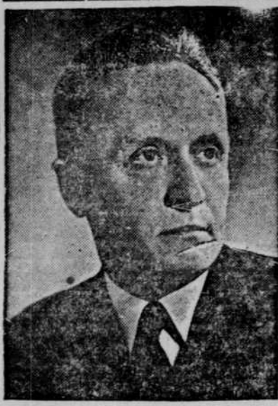
Dr. Walter A. Maier

—Publicity Department— 3558 South Jefferson Ave. Saint Louis, Missouri