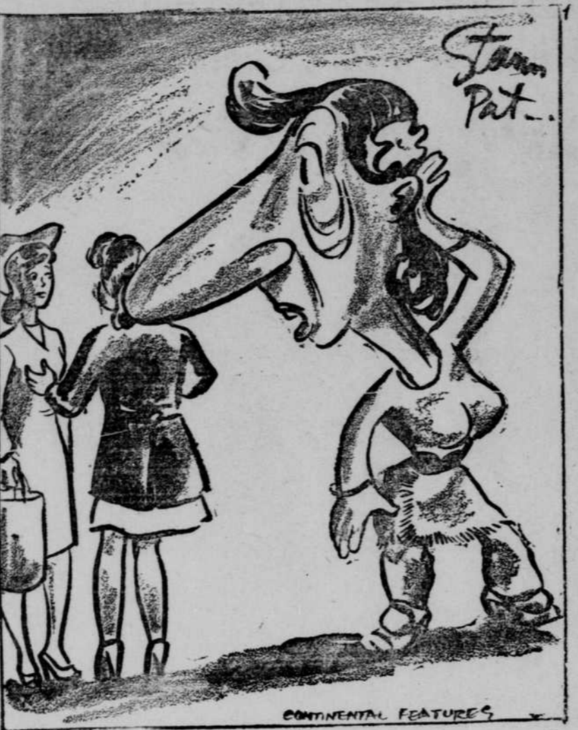
Unless you are a Durante, it doesn't pay to be nosy. Do avoid interfering in other people's affairs.

I have been thinking of closing down my place until it is over. Do you think this would be a wise move.