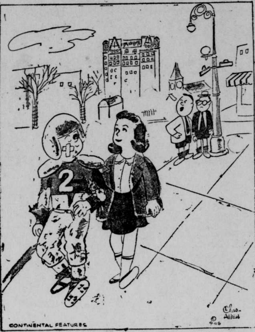
"They'll go for anything in uniform!"