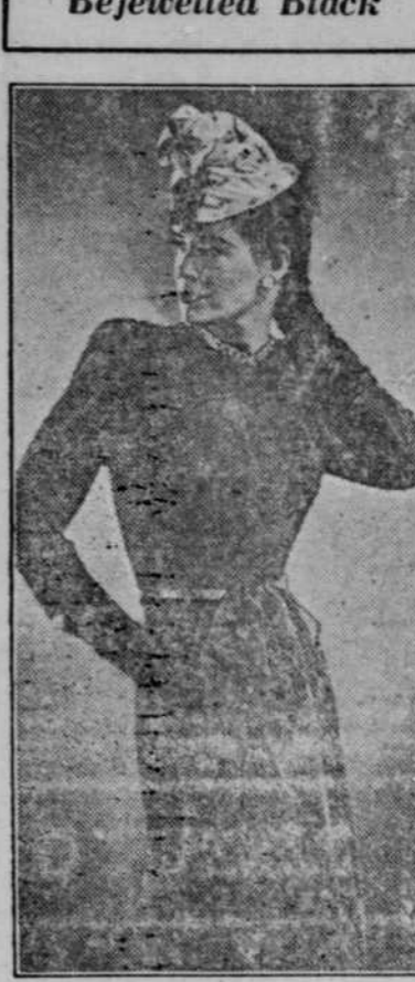
BE glamorous in the afternoon in this black rayon crepe dress with jeweled belt and necklace. Rayon crepe is especially suitable to this type of dress because of its excellent draping quality, rich, dull texture. A new leaflet, "Planning Your Wardrobe," contains many hints that will help you in your shopping. To obtain this, send a stamped, self-addressed envelope to the Woman's Department of this newspaper.