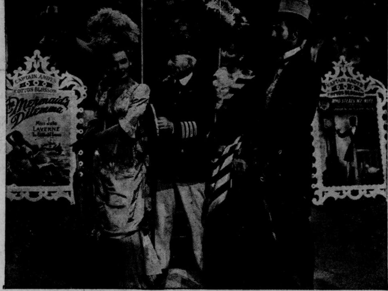
SWINGING ON THE SHOWBOAT. (CNS)—Two Hollywood prima donnas of popular songs are among the gasily of stars in "Till the Clouds Roll By". All dressed in a sweet old-fashioned crown is Lena Horne with Virginia O'Brien, singing memorable Jerome Kern melodies in the lavish "Showboat" sequence of the film.