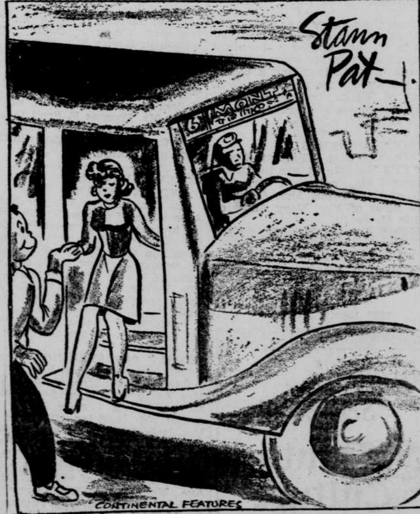
"It's expected of you Chum. You're suppose to help her on or off the various means of transportation."