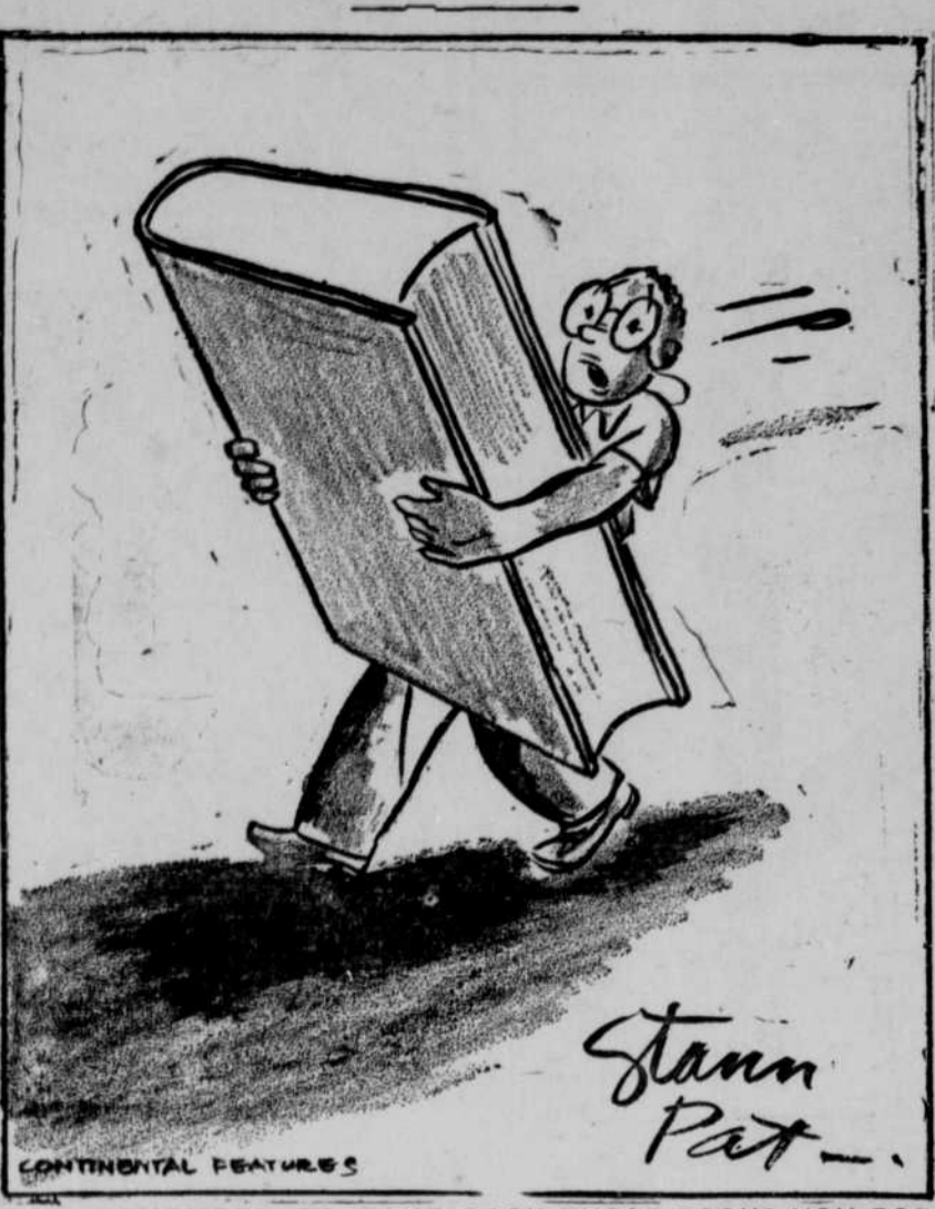
DO REMEMBER TO TAKE BACK THOSE BOOKS YOU BORROWED, CHUM, 'TAINT YOURS YOU KNOW...