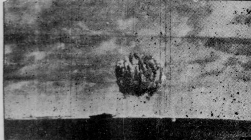
BAKER DAY A-BOMB EXPLODES

JERUSALEM, Palestine—Radiophoto-Soundphoto—First picture to arrive in the U. S. showing the bomb-blasted King David Hotel here after last week's explosion in which an estimated 93 persons were killed. Today British troops in battle dress are staging the greatest manhunt in Middle East history seeking extremists who did the bombing.