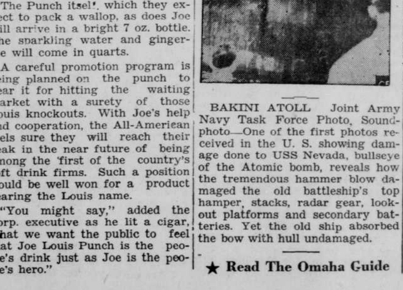
BAKINI ATOLL —One of the first photos received in the U. S. showing damage done to U.S. Nevada, bullseye of the Atomic bomb, reveals how the tremendous hammer blow damaged the old battleship's top hamper, stacks, radar gear, lookout platforms and secondary batteries. Yet the old ship absorbed the blow with hull undamaged. ★ Read The Omaha Guide