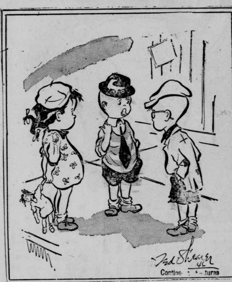
"An" she's the girl who raised such a rumpus at the hospital about five years ago...!!!"

works out of town and I want to know if I should send him a telegram some night after his working hours are over—should I do this? He claims he loves me.