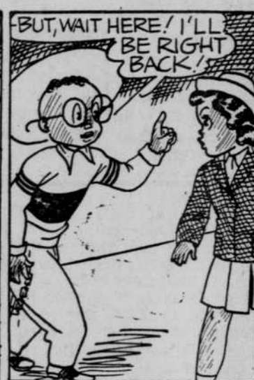
By T. MELVIN