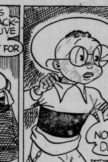
By MELVIN TAPLEY