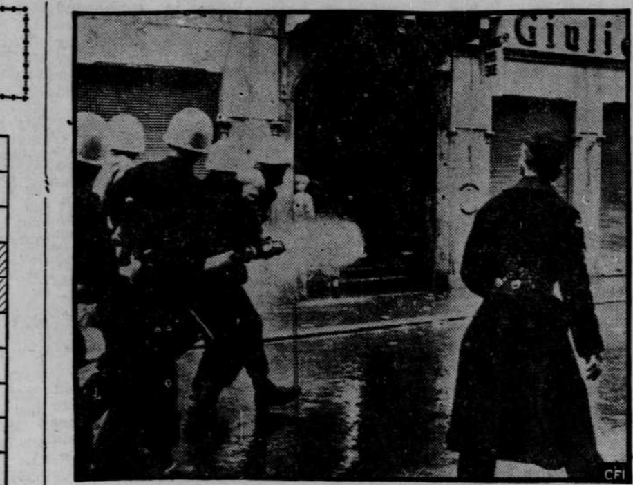
PRO TITO AGITATORS RIOT IN TRIESTE WASHINGTON, D. C.— —Civil guards mop up with a fire hose in effort to disperse pro Tito agitators who staged a demonstration during the visit of a United Nations Commission to Gorizia, Italy. Two of the demonstrators may be seen huddled in a doorway to escape the water.