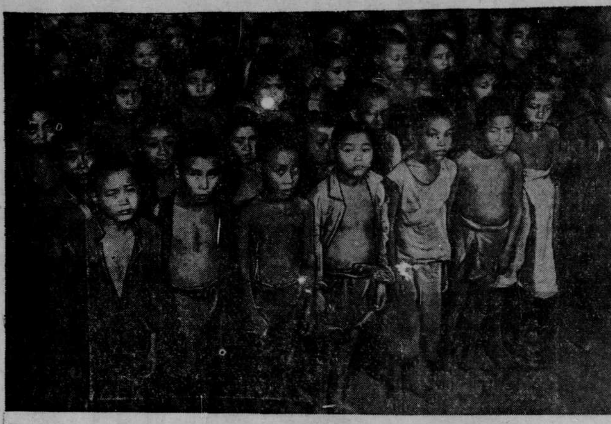
THESE Chinese war orphans must face the winter in threadbare rags. You can help them and millions of others who experienced the terror of war. Give all the clothing, shoes and bedding you can spare to the Victory Clothing Collection for relief of war victims. Let your old clothes take on new life overseas.