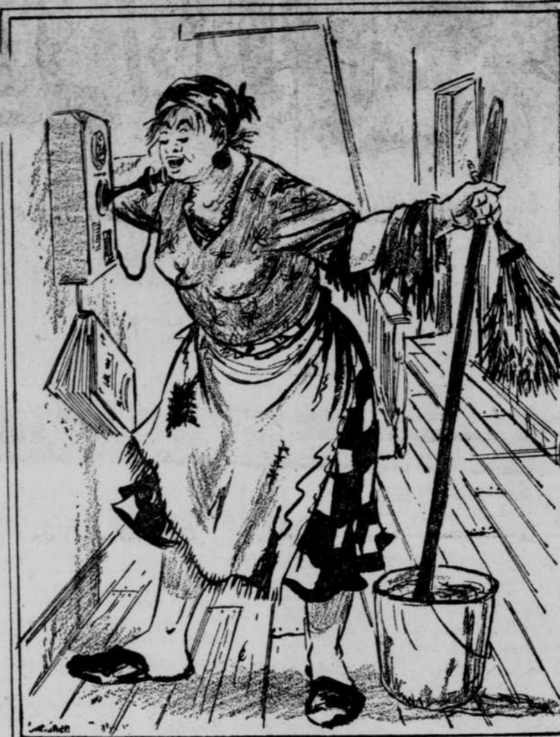
"And I could like you also—from the sound of your voice!!!"