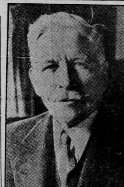
HURLEY RESIGNS IN PROTEST Washington, DC. —Patrick J. Hurley resigned last week as U. S. Ambassador to China with a charge that professional diplomats in the State Department are sabotaging the basic principles of American foreign policy.