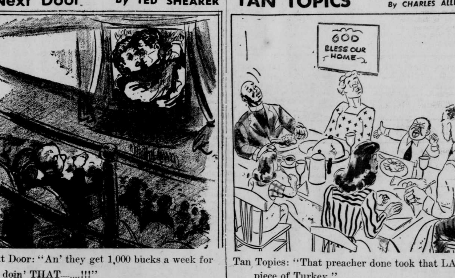
Next Door: "An' they get 1,000 bucks a week for doin' THAT.....!!!" Tan Topics: "That preacher done took that LAST piece of Turkey."