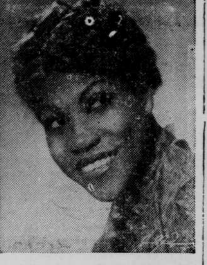
Sister Rosetta Tharpe is just that