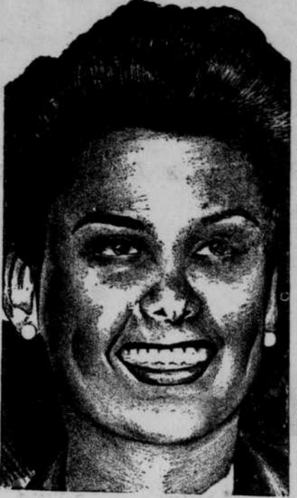
White apartment . . . and saw young, attractive Jane White, was how well she personifies the character of "Nonnie."

LENA HORNE FORCED OUT OF LEAD ROLE IN "ST. LOUIS WOMAN" BY ACTION OF NAACP SECY.