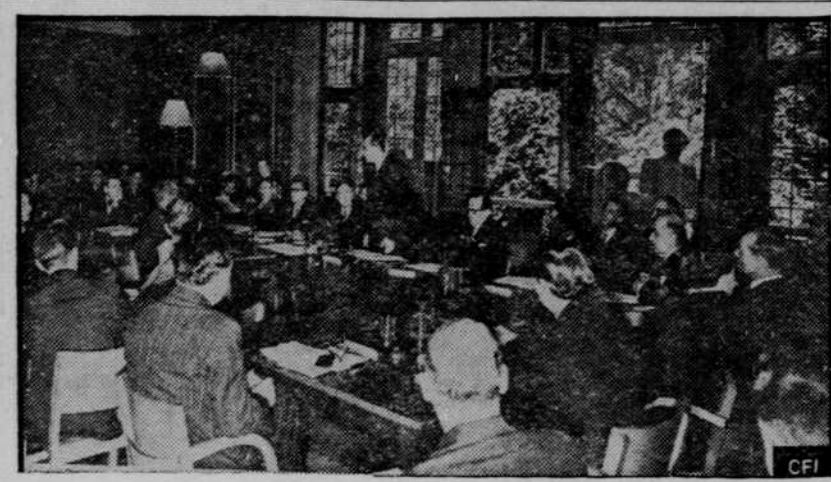
FIRST MEETING OF THE UNITED NATIONS COUNCIL COMMITTEE —London, England—A history making occasion, the first meeting of the Executive Committee of the Preparatory Commission of the United Nations is pictured here. Sitting at Church House, Westminster, the committee heard Mr. Noel Baker, Minister of State, who presided, deliver the opening address. Mr. Wellington Koo, Chinese Ambassador in London, replied to the opening speech. This British official photograph shows Mr. Noel Baker delivering his address.

Encourage your white neighbors to subscribe to THE OMAHA GUIDE and learn what the darker one tenth of the American population is thinking and doing.