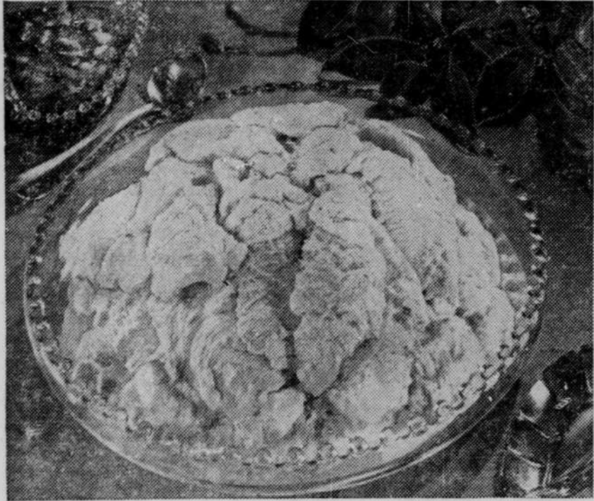
Luscious Ice Cream—Favorite Summertime Dessert (See Recipes Below)