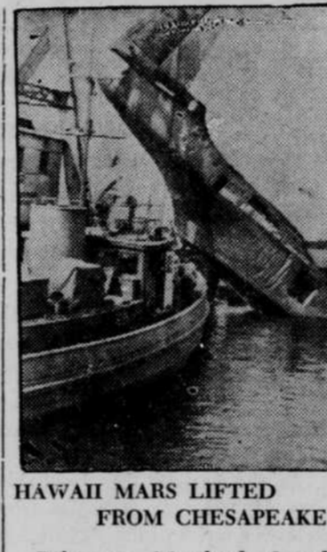
HAWAII MARS LIFTED FROM CHESAPEAKE BAY

Parkyakarkus, temporarily the town hero, really hits the jackpot of trouble on the "Meet Me at Parky's" show next Sunday, August 26. A matril-