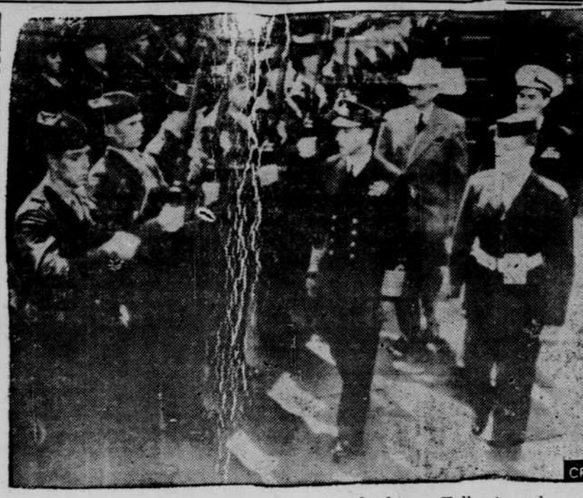
GING GEORGE VISITS

New York—The right of petition by dependent peoples, the right of the International Organization being formed at San Francisco to investigate and remedy these complaints, and insistence on independence for colonies was urged by the NAACP in a wire to Secretary of State Edward R. Stettinius, Jr., who is chair-