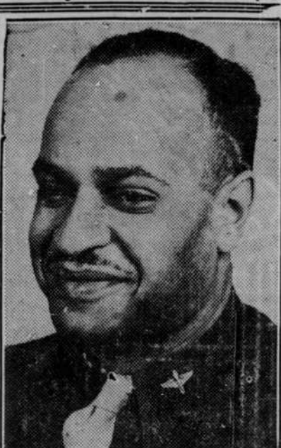
Released by U. S. War Department, Bureau of Public Relations.

Fertilizers are of no value to the plant unless the soil contains ample moisture and air. Fertilizers should not be applied to dry soil; so, during periods of drought, artificial watering should be practiced. On soils known to be highly acid or deficient in calcium this condition can be corrected by applying agricultural ground limestone or hydrated lime at a rate of 50 to 70 pounds per 1,000 square feet. The rate of application of lime should be based on soil tests, and lime should be applied only if analysis shows it is necessary.