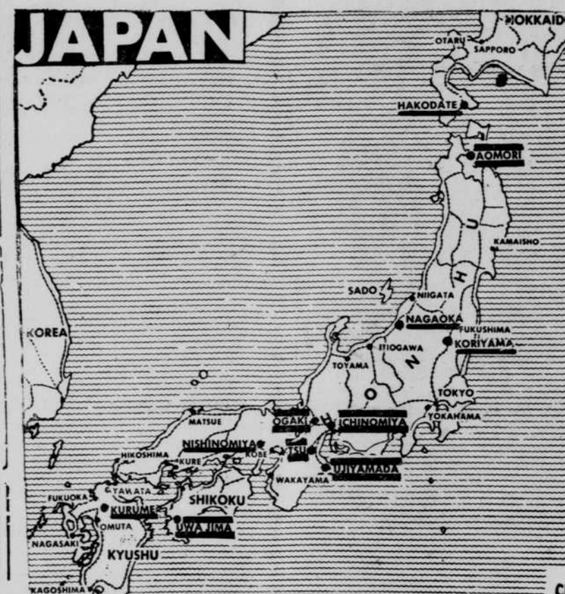
B-29'S HIT 6 OF THE 11

Plymouth, England—Radiophoto—Soundphoto—King George VI, visiting President Truman aboard the cruiser Augusta leads the party inspecting the Marine Guard of Honor lined up on the deck of the American cruiser. With the King is the Marine Captain commanding the detachment