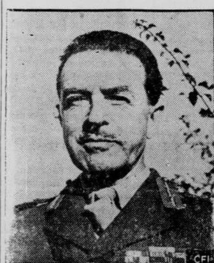
NEW GOVERNOR-GENERAL OF CANADA