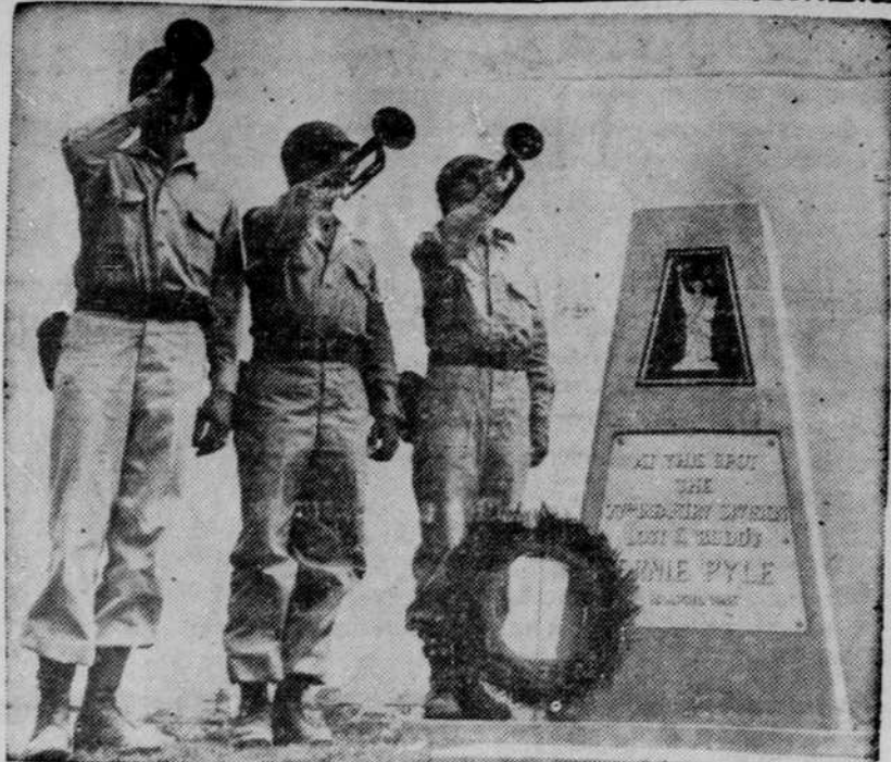
ERNIE PYLE MONUMENT

On returning from a play in Harlem one evening, he wrote for his