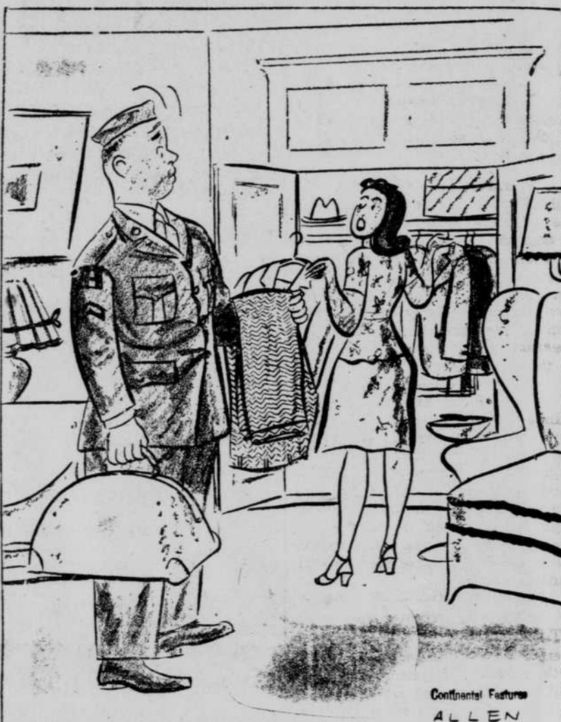
I saved all your old suits, but I had no idea you'd gained fifty pounds.