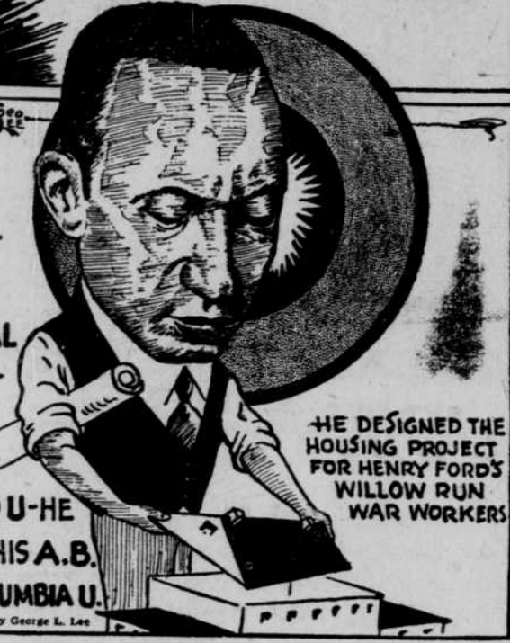
HE DESIGNED THE HOUSING PROJECT FOR HENRY FORD'S WILLOW RUN WAR WORKERS

ONE OF AMERICA'S LEADING ARCHITECTS IN THE FIELD OF FEDERAL CONSTRUCTION HAS DESIGNED HOUSING PROJECTS COSTING MORE THAN $10,000,000. ONCE HEAD OF THE DEPT. OF ARCHITECTURE AT HOWARD U. HE STUDIED IN EUROPE AND RECEIVED HIS A.B. FROM U. OF PENN. AND M.A. FROM COLUMBIA U.