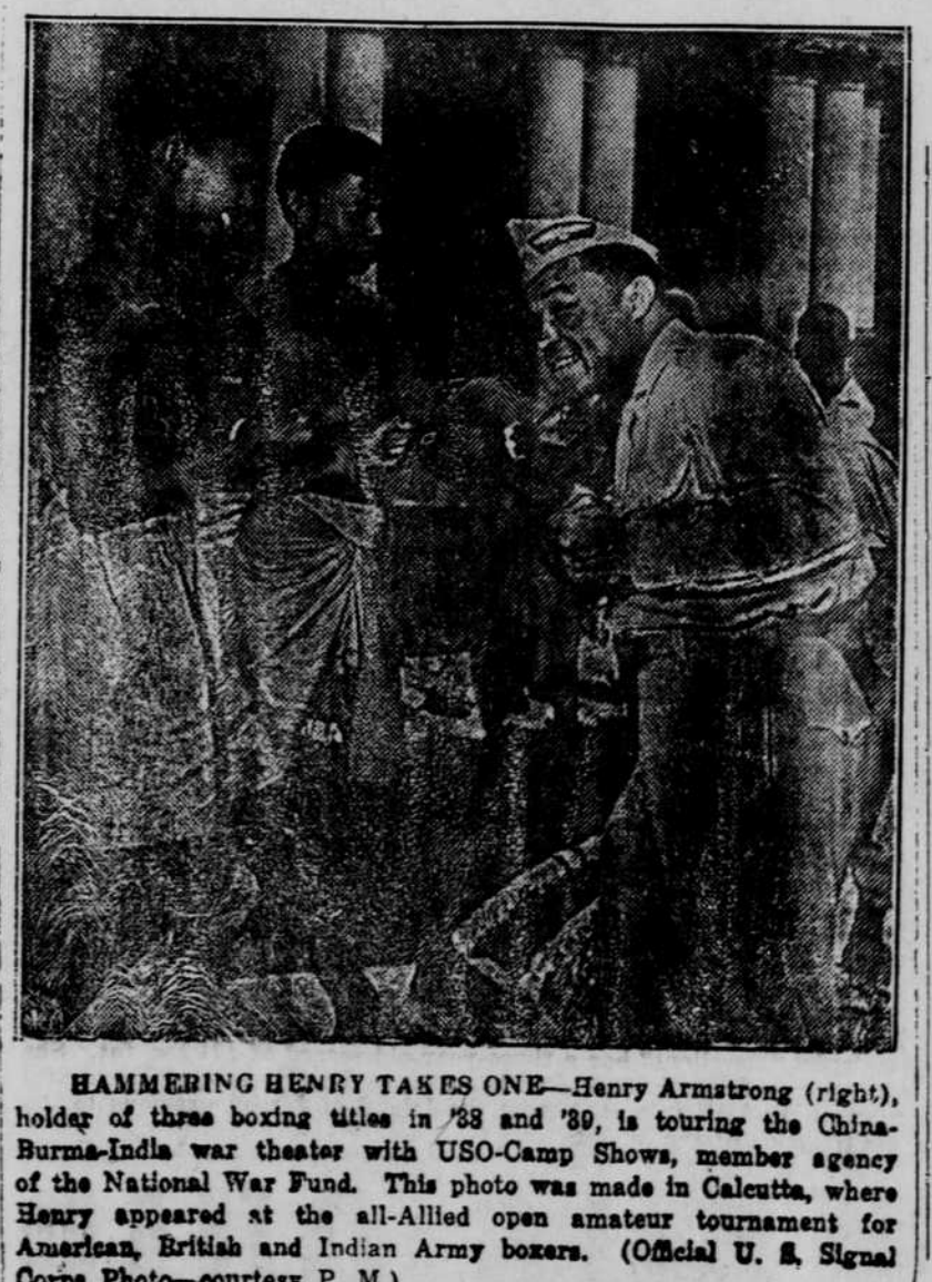
HAMMERING HENRY TAKES ONE —Henry Armstrong (right), holder of three boxing titles in '28 and '30, is touring the China-Burma-India war theater with USO-Camp Shows, member agency of the National War Fund. This photo was made in Calcutta, where Henry appeared at the All-Allied open amateur tournament for American, British and Indian Army boxers.