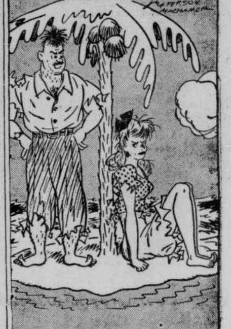
"Frankly, I wish you'd been a case of Wheaties!"

JAN CHRISTIAN SMUTS San Francisco, Calif. Soundphoto Venerable and courtly Field Marshal Jan Christian Smuts, Prime Minister of the Union of South Africa, is pictured during a press conference in the Veteran's Memorial Building on a sessionless day for the United Nations Conference on International Organization at San Francisco.