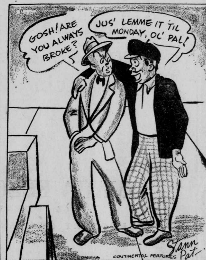
Do try and live within your means and not try your friends!.. Thrift leads to social, economiuc and political seururity and independence.