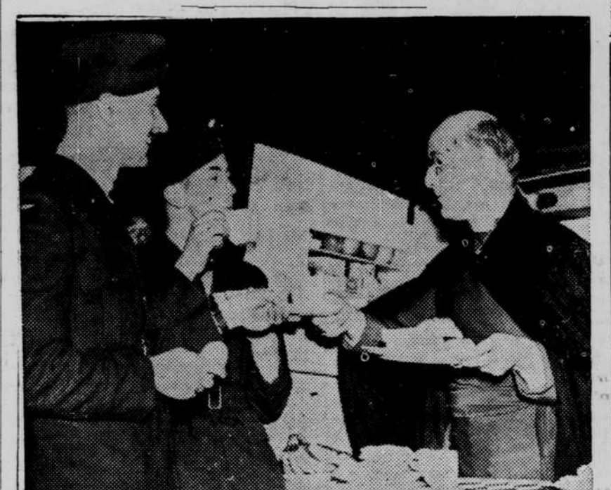
The newly appointed Archbishop of Canterbury, Geoffrey Francis Fisher, serves tea at a service dedicating seven Church Army mobile canteens for work among the armed forces. The ceremony took place in the courtyard of Fulham Palace. The Archbishop soon to be enthroned succeeded the late William Temple. He has been Bishop of London for the past five years. Previously he had been Bishop of Chester. He is 57 years old, father of six boys, four in the Army.