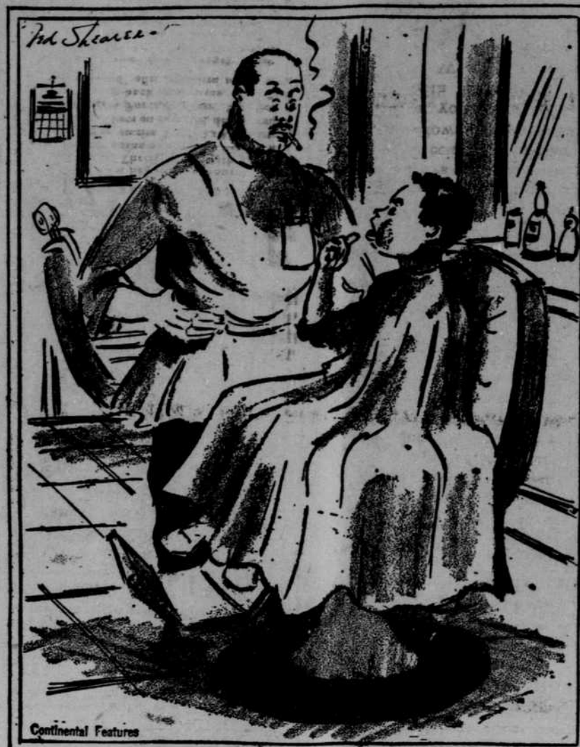
"CUT IT ALL OFF—I'M MOVING INTO A TOUGH NEIGHBORHOOD . . . !!"