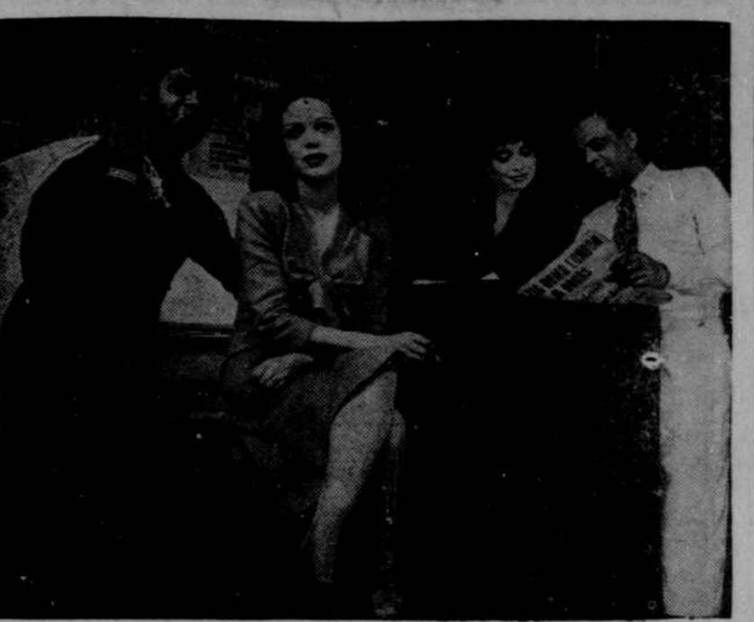
Left to rights Canada Lee, Hilda Simms, Alice Childress and Alvin Karpis at the Mansfield Theatre New York.