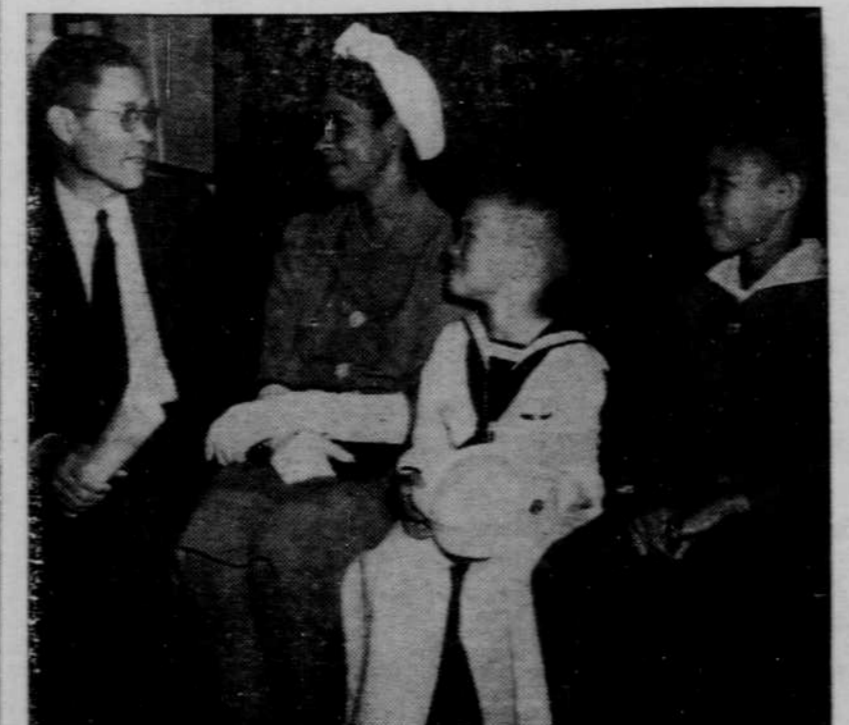
FIRST NEGRO LIEUTENANT IN NAVY CONGRATULATED BY HIS FAMILY

He is a member of the National Technical Association, the American Association of Engineers and the Kappa Delta Pi Fraternity of Columbia University.