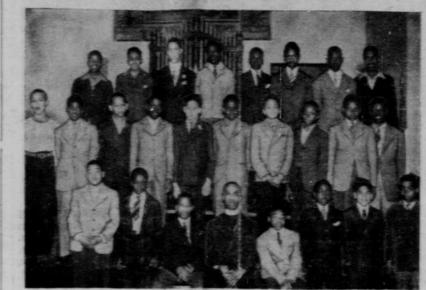
The club, pastor in center... each must be diligent.

STEP IN RIGHT DIRECTION TO HELP CURB JUVENILE DELINQUENCY