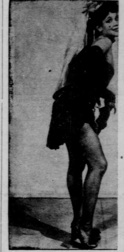
Katherine Dunham Exotic, alluring, spectacular, are the terms nightlifers in Chicago are using to describe Katherine Dunham and her troupe now playing the Blackstone Theatre. Under the very descriptive title "Tropical Revue," the current attraction runs the whole gamut of the terpsichorean art.