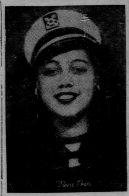
"DUBBED DETACHMENT UNITS WALLET GAL"

The Auxiliary had the regular ty Contest in 1942. Monday dinner this week and did quite well with it.