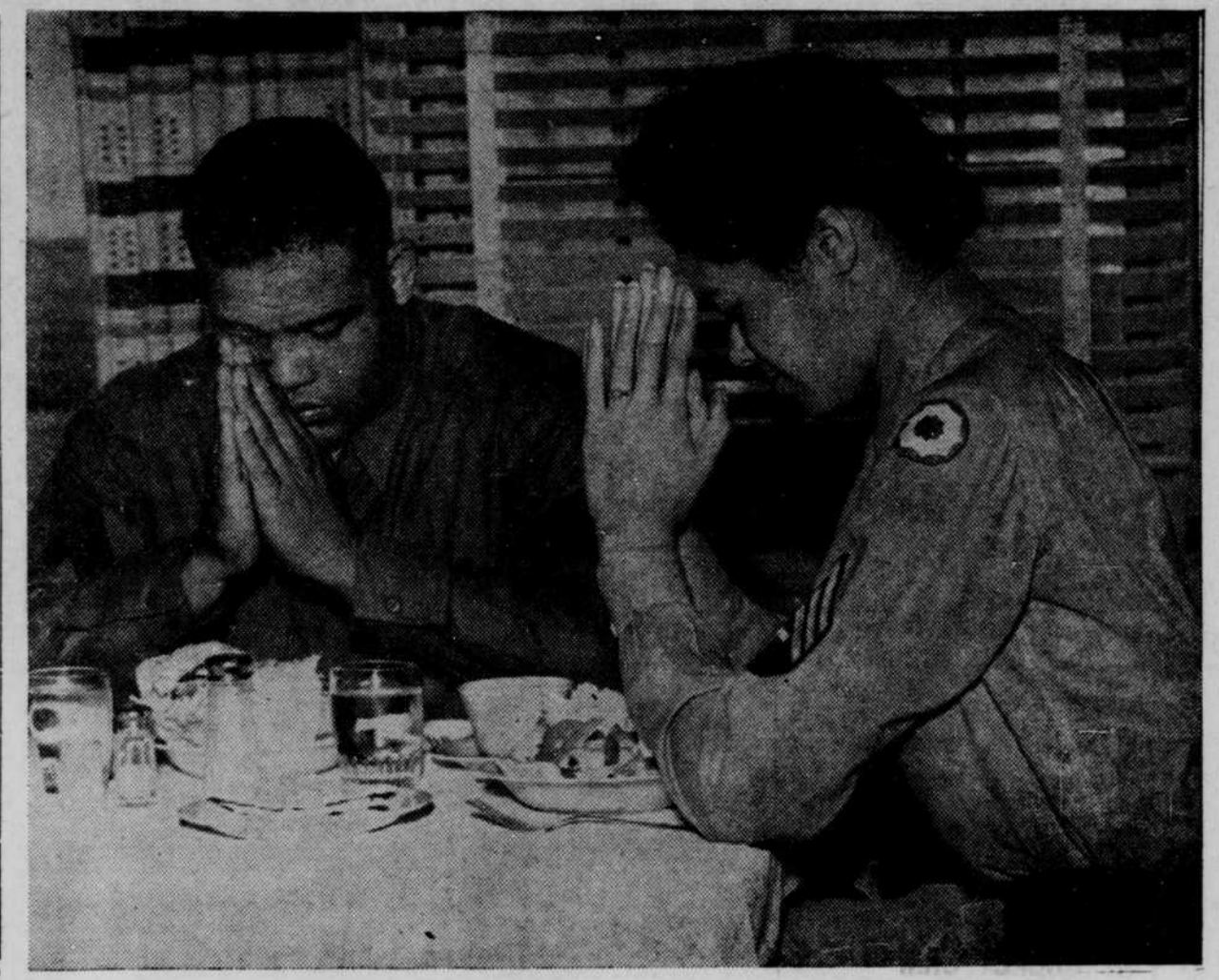
THANKSGIVING AT HUACHUCA At Fort Huachuca, Arizona, Sgt. Joe Louis Barrow, world's heavyweight champion, is shown with