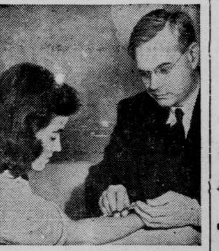
High school girl, above, receives tuberculosis test from doctor. Tuberculosis associations, supported by Christmas Seals, help guard health of school children.

Hotel Maids Good Hours—Good Wages CONANT-SANFORD HOTEL