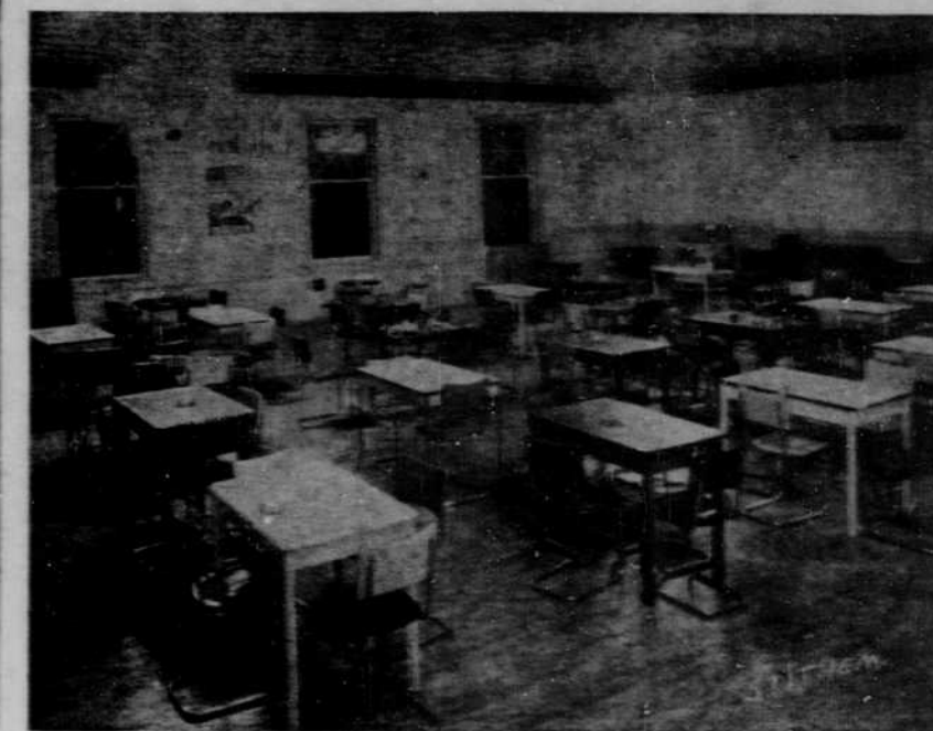
This is a photo-view of the beautiful Lounge and Bar room of the Roosevelt Post No. 30, American Legion, which will be open "24 hours a day" to accommodate visiting Legionnaire delegates, auxiliaries, and friends, during the American Legion National Convention here, Sept. 20-23, 1943.