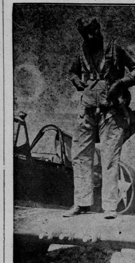
Bureau of Public Relations U. S. War Department STIMSON PRAISES '99 LAUDS OTHER UNITS—(Continued from Page 1)

working very vigorously and get- ting along well together with all other troops." He had no com- ment to make as to whether there had been any reports to the con- trary.