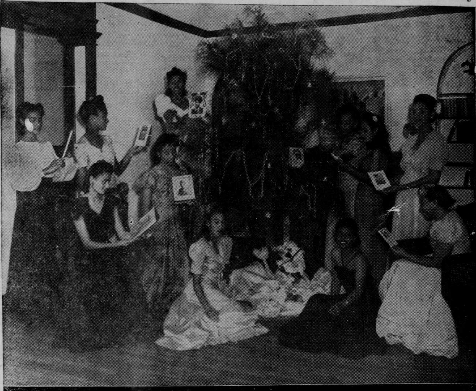
FORT VALLEY STATE COLLEGE GIRLS KEEP THE HEART FIRES BURNING!

Co-eds at the Fort Valley State College, Fort Valley, Georgia, remembered the boys in the Armed Forces at Christmas time for that was a good time for the boys to remember what they are fighting for.