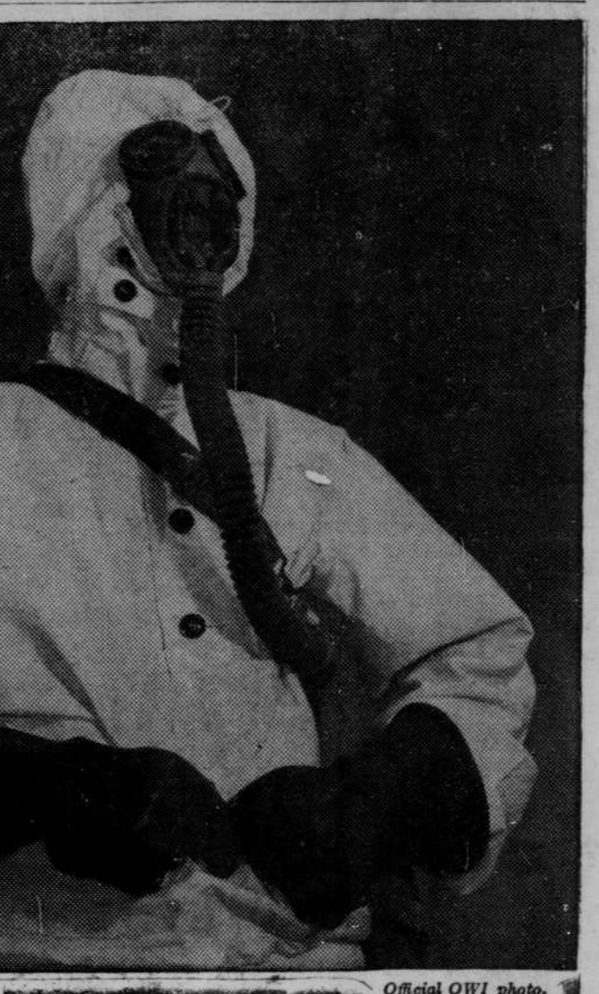
THE MAN FROM MARS might well be the description given our new soldiers of chemical warfare. The protective clothing and gas mask of the warrior above is similar in many respects to that worn by members of the Negro decontamination unit in Australia.

There is a hidden strength to freedom, an innate power which is invincible. Fearful souls speak much of the might of the totalitarian nations, of the forces of despotism. But all of these are as nothing beside the strength of freedom.