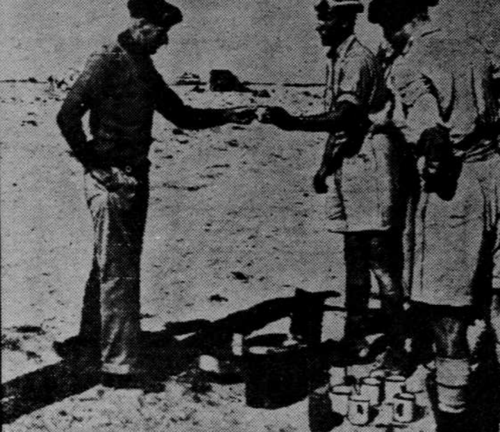
CAIRO, EGYPT—This radiophoto sent from Egypt to New York showing General Montgomery, left, Commander of the British Eighth Army that is pursuing the German Africa Corps across the desert.