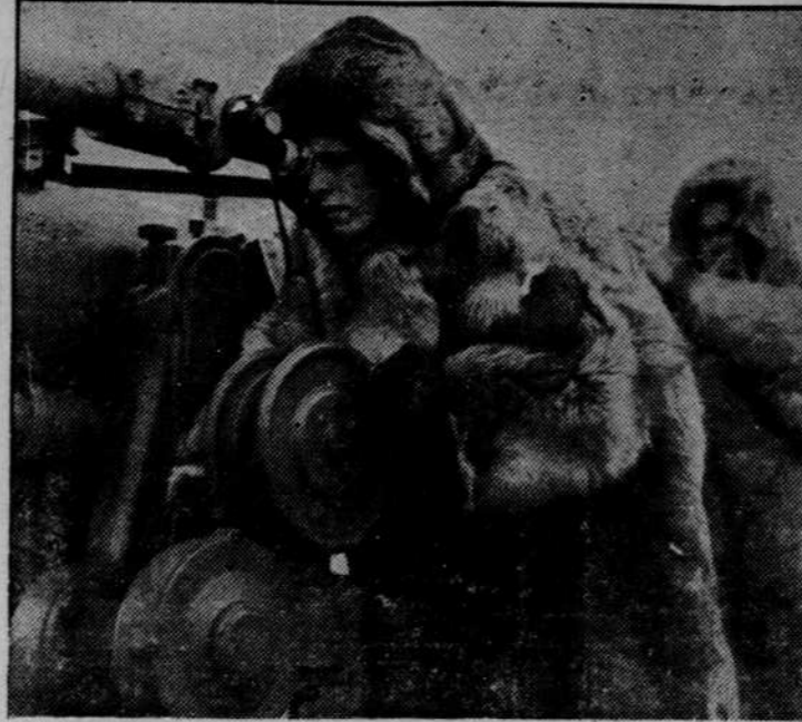
AT SEA—Two members of a U. S. Navy gun crew are shown at their stations, buffeted against the icy blasts that sweep down from the Arctic across the Northern convoy route to Russia.