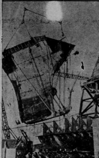
RICHMOND, CALIFORNIA — A new world's record for Liberty ships of four days and fifteen and one half hours from keel laying to launching was chalked up at the shipyards here when the epic-making vessel, the "Robert E. Peary" slid down the ways.