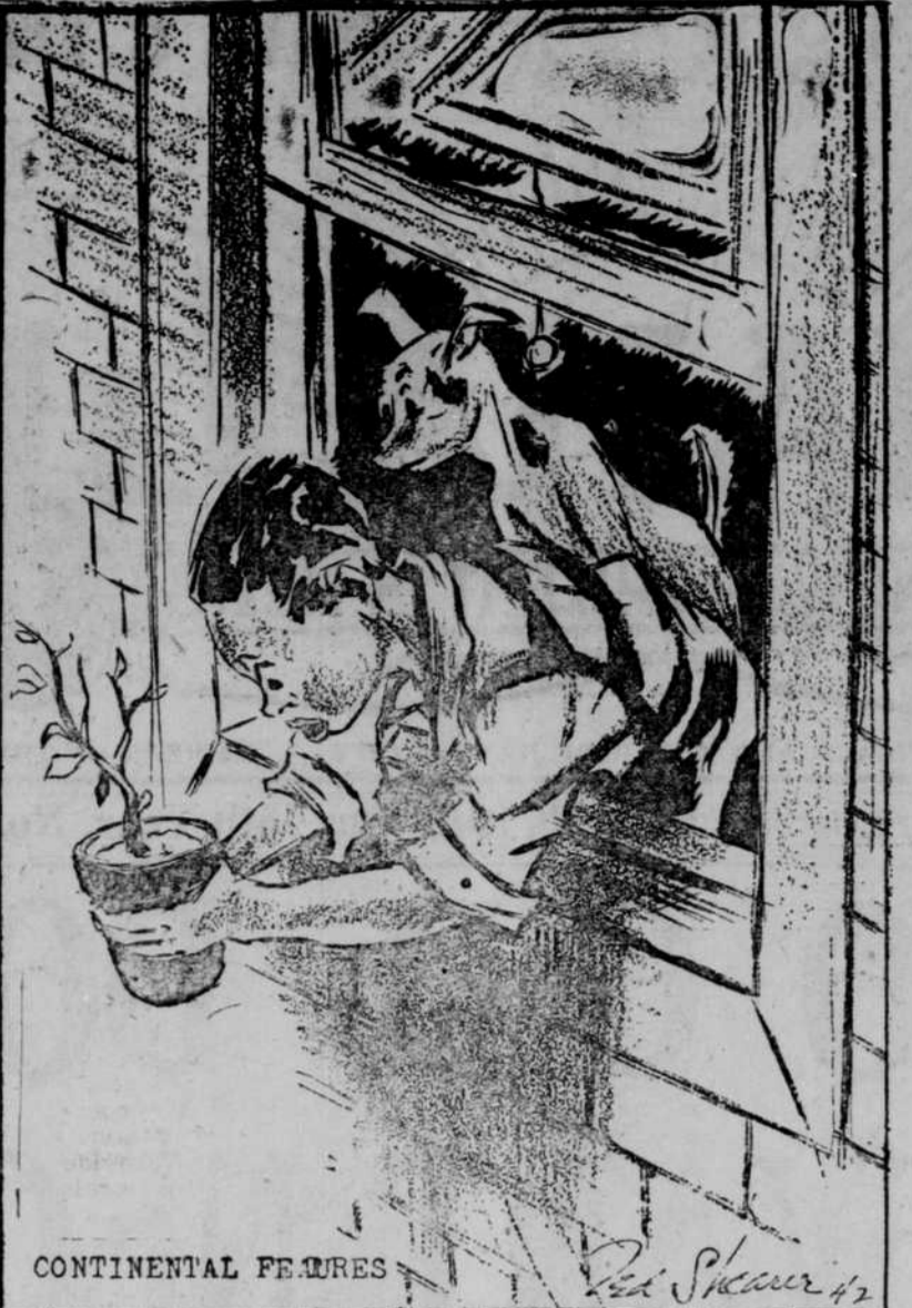
"GOSH—I WISH MOM WOULD STEP AWAY FROM THAT TRUANT OFFICER"