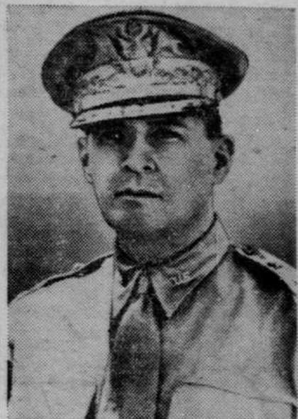
Gen. Douglas MacArthur, new supreme United Nations commander in the Australian offensive, and who reached that continent with his family after a harrowing seven-day trip by sea and air.