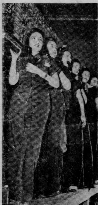
These "quotation girls" in the employ of the New York curb exchange are working at the board with chalk and eraser, filling the shoes of young men who have gone forth to fight the Japs. This is just another instance of how women are taking over men's work.