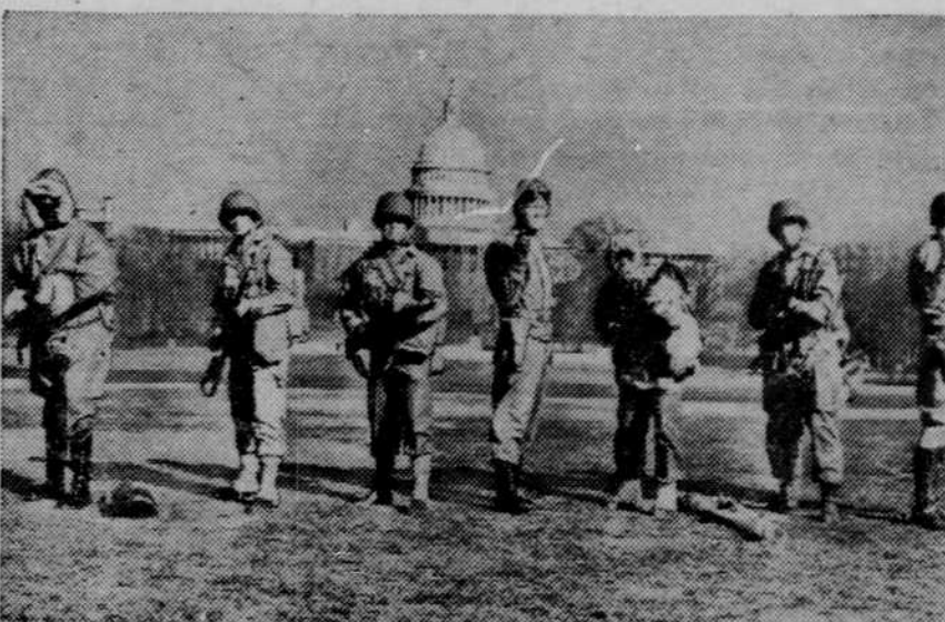
Ready to fight anywhere in the wide world, these U. S. soldiers are dressed in the uniforms adopted by the army for action under various conditions. The uniforms are, left to right: snow shoe trooper; summer and tropical field; winter field; armored force; ski trooper; paratrooper and summer mounted