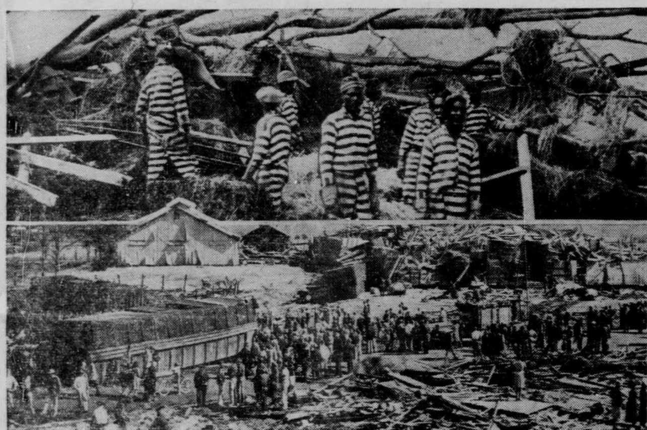
Homes were leveled and rolled together as so much paper by a tornado which swept through Mississippi and laid low farm buildings and towns in its wake. In the upper picture convicts from a nearby prison remove a great store of hay which fell upon livestock when the wind played havoc with it, at Berclair, Miss. Lower picture was taken at Grenada, Miss. The wind that caused this damage just missed a hospital which stood near by. Note the spectators, standing about in dazed wonder.