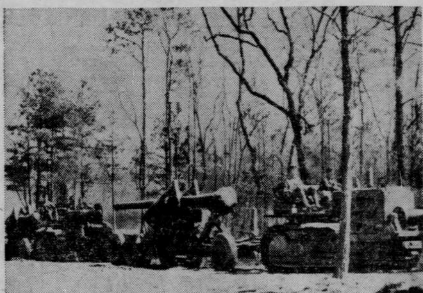
This soundphoto shows tractors dragging a string of 155-mm. field rifles through a pine woods on the way to target practice, at Fort Bragg, N. C. The gun and tractor weigh 39 tons together. The 155's mobility and 17-mile range make it the biggest field gun in the U. S. army's locker.