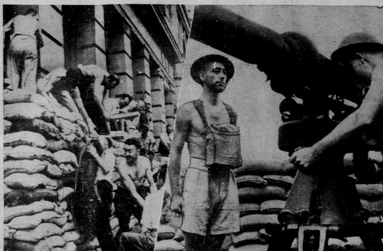
There is no city in Australia that can quietly sit back with the assurance that it will not be bombed by Japs. In the picture at the left, Melbourne city employees are doing their Australia-day task, erecting an ARP sandbag barricade outside of their working premises. Right: Members of the anti-aircraft battery man a height and range-finder at an action station in Darwin, Australia. The men work stripped to their waists.