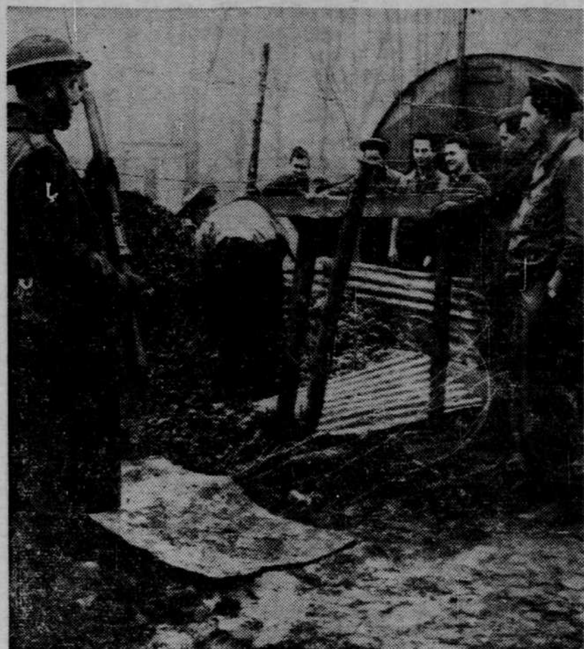
The nights in Ireland are a little dampish and chilly at this season of the year, and Uncle Sam's doughboys'll be wanting a bit of a fire to take the chill off the place. This photograph, taken somewhere in Northern Ireland, shows U. S. soldiers at the coal pile awaiting their turn to fill up their buckets.