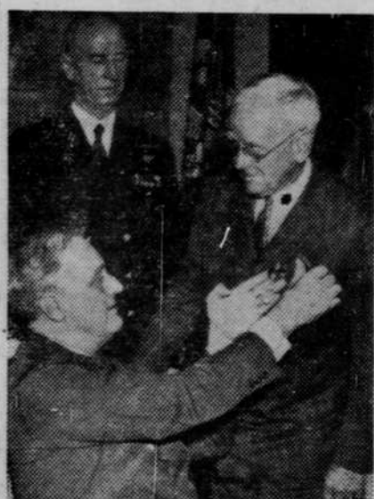
President Roosevelt pins Distinguished Service medal on Rear Admiral William Standley, on eve of his departure for Moscow as U. S. ambassador. The award was for "meritorious service."