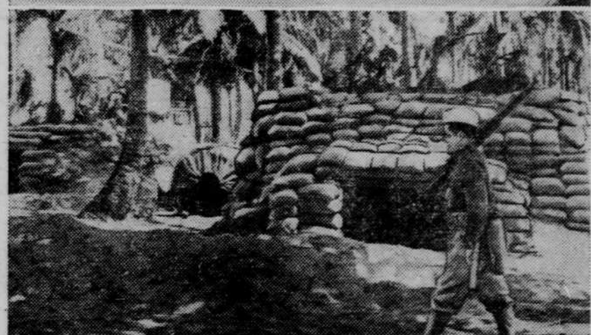
These two pictures are typical scenes along the coasts and in the interior of Puerto Rico, where the United States has established a base to guard the approaches to the Caribbean sea and the Panama canal. At the top a coast defense gun points its snout over a sandbagged emplacement. Below a sentry paces his post in the interior.