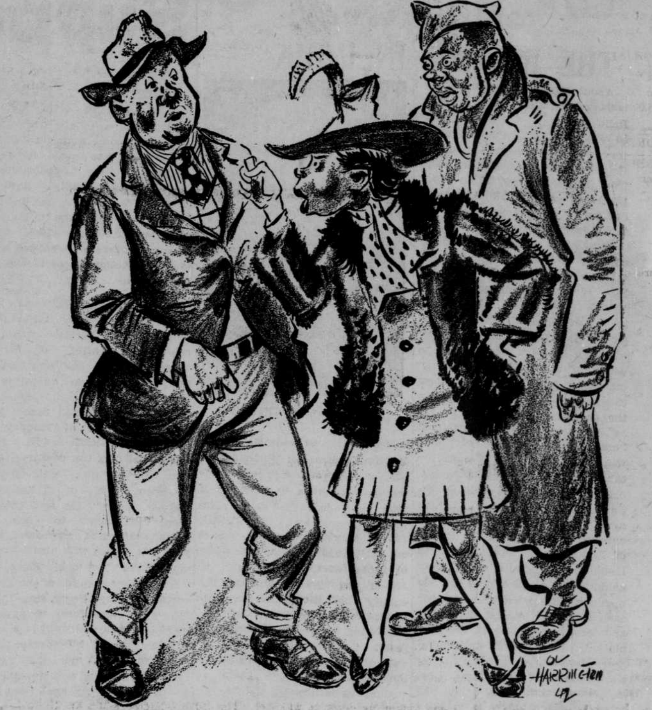
AN' DON'T EVER BOTHER ME NO MORE—I DON'T WANT NOTHIN' THE ARMY TURNED DOWN. MY REQUIREMENTS IS HIGHER THAN ANYBODY'S ARMY.