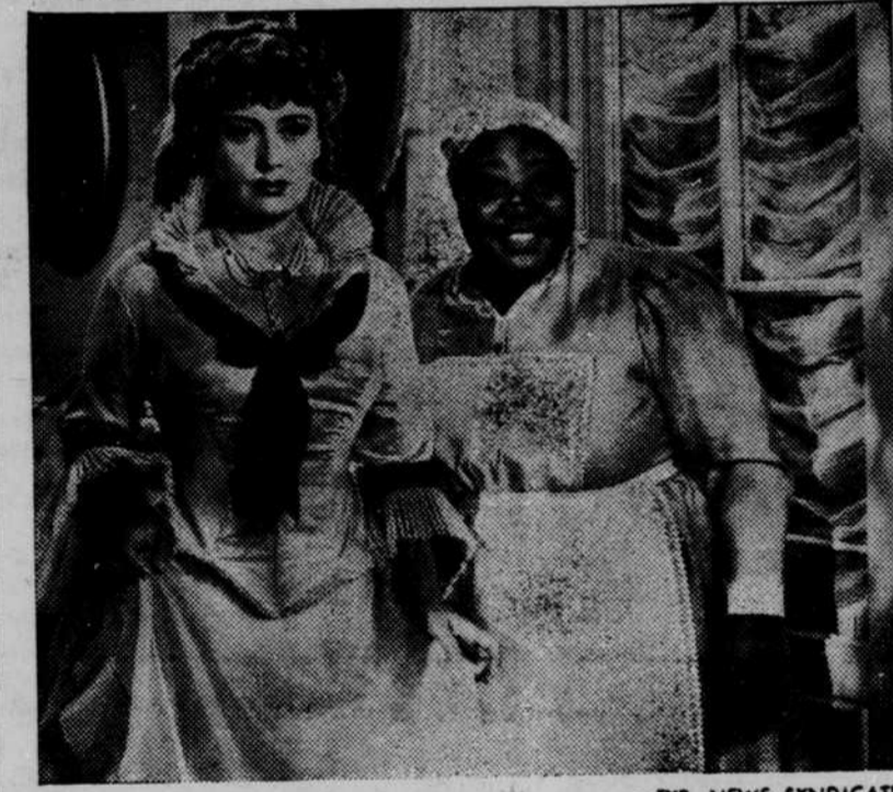
Joan Blondell and Hattie Noel shown above will soon be seen in the new Republic picture, "Lady for a Night." Co-starred with Joan in the male leads are John Wayne and Ray Middleton, two of Hollywood's most famous he-men. The picture is lavishly produced and presents a thrilling, highly dramatic theme.

but the Negroes were brought to the New World as slaves. As descendants of free settlers and immigrants, we owe an opportu- nity to the descendants of those who were brought here shackled. "As we approach the anniver- sary of the birth of Abraham Lin- coln, we think of that great Pres- ident who struck the chains of hu- man bondage from the Negroes. Let us dedicate ourselves to the task of striking off the chains of prejudice which retard their progress in the total efforts of our country to win the war."