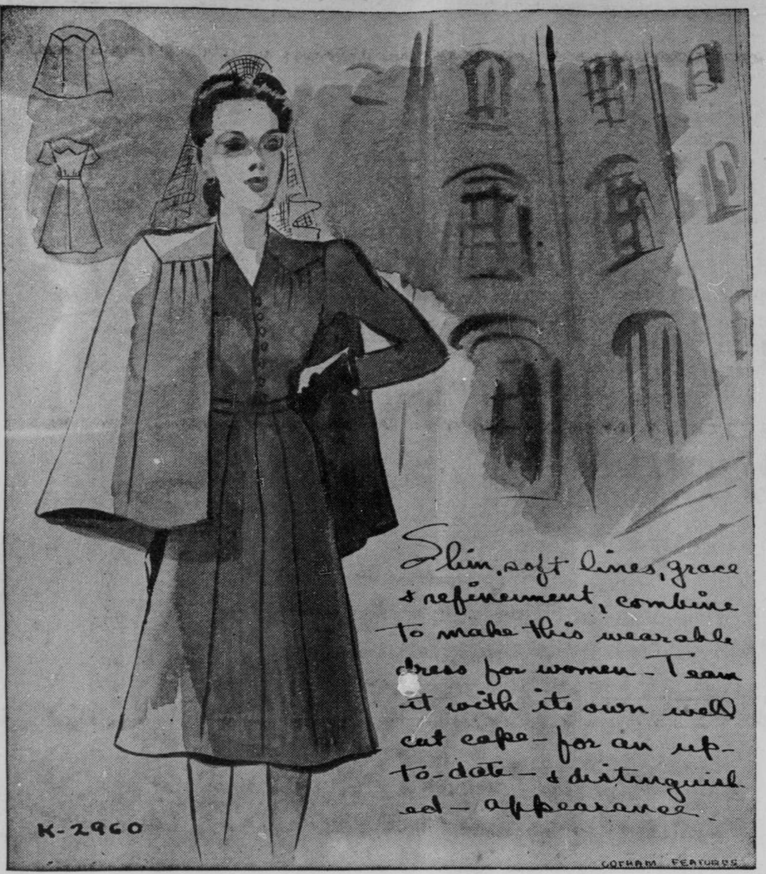
Sizes 36 to 52. Size 36 requires 2 1-4 yards of 54 inch fabric for dress and 1 1-2 yards for cape.