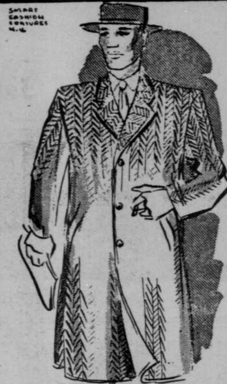
WARM AND LIGHT TOPCOAT OF KNIT TWEED Pictured, a smart model topcoat of knit tweed fabric reproducing the color and qualities of English hand-loomed tweeds—good resistance to wind and rain.