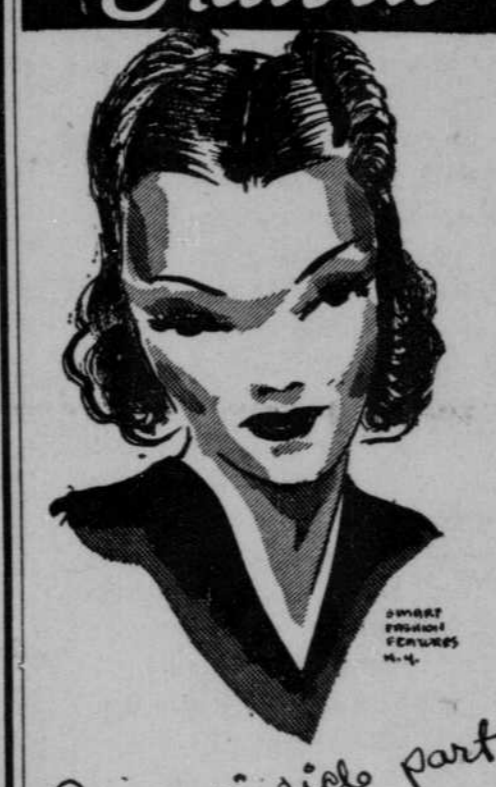
The semi side part makes the ordinary hair do different and people wonder why