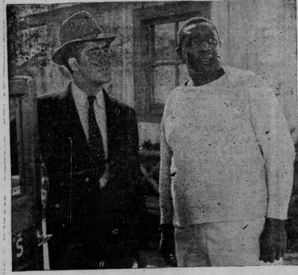
Billy Conn, sensational heavyweight fighter, is shown here with Ernest Whitman, popular character star, in a scene from Billy's first motion picture, Republic's "The Pittsburgh Kid." Whitman, remembered for his excellent characterization of the faithful servant in "Jesse James," is importantly cast as Conn's trainer in his newest film.