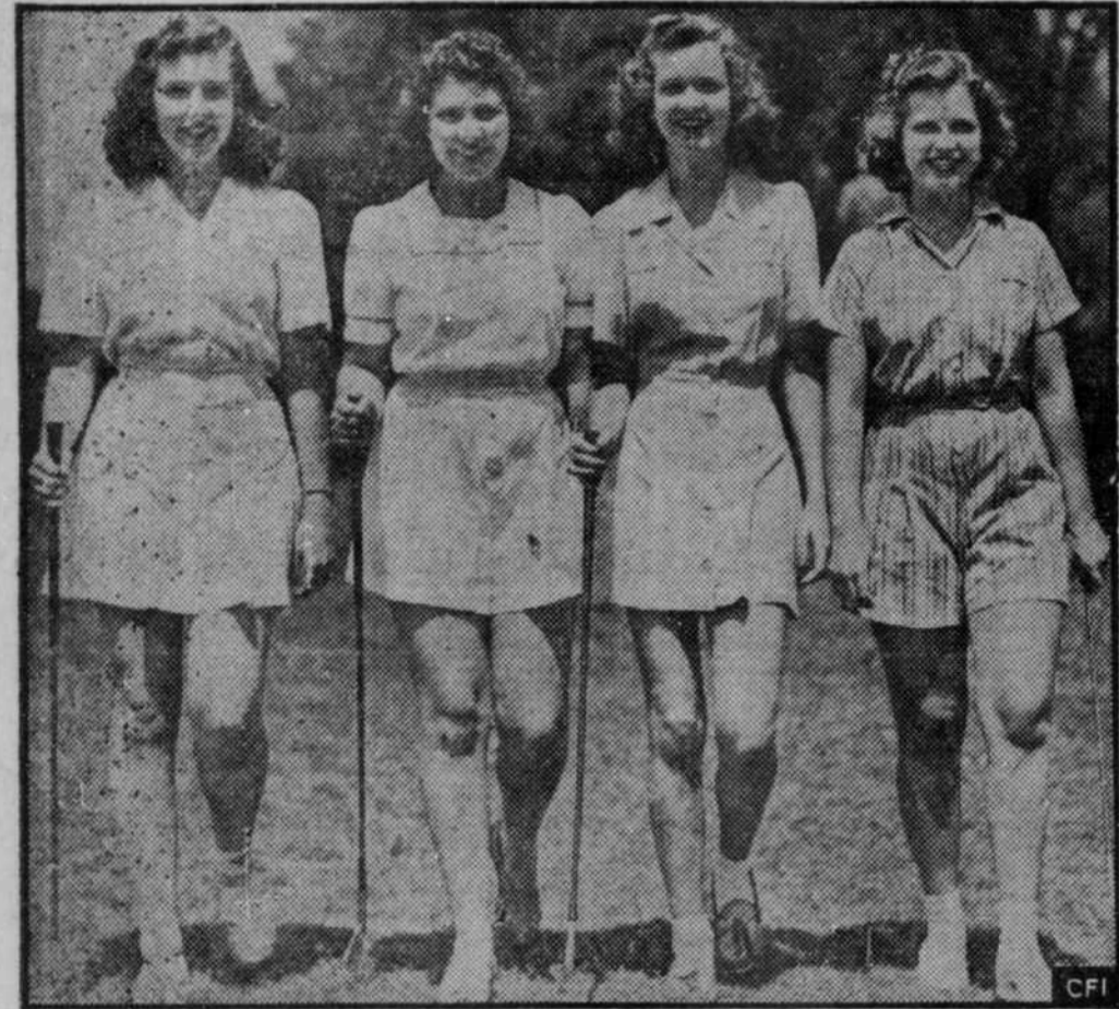
KNOXVILLE GIRLS O. K. 'YOO-HOOS'