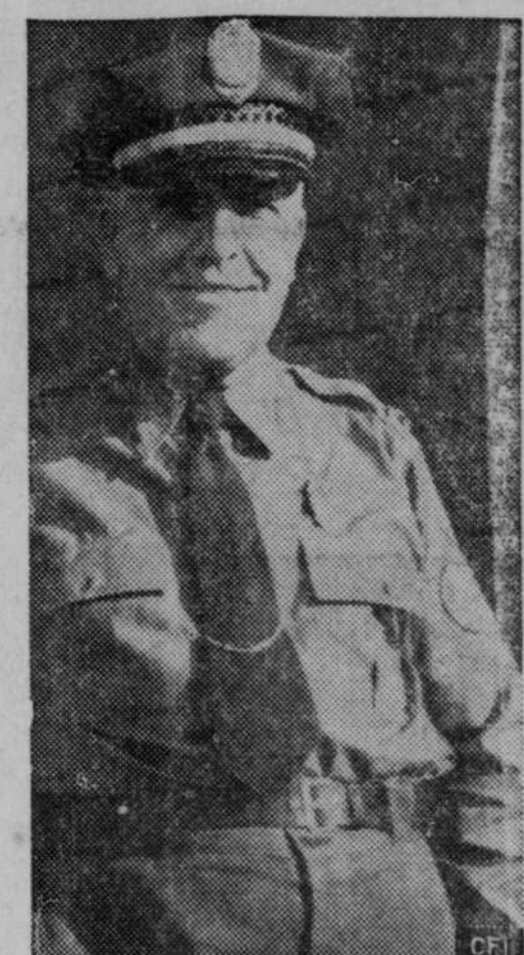
OLDEST GAME WARDEN IN COUNTRY