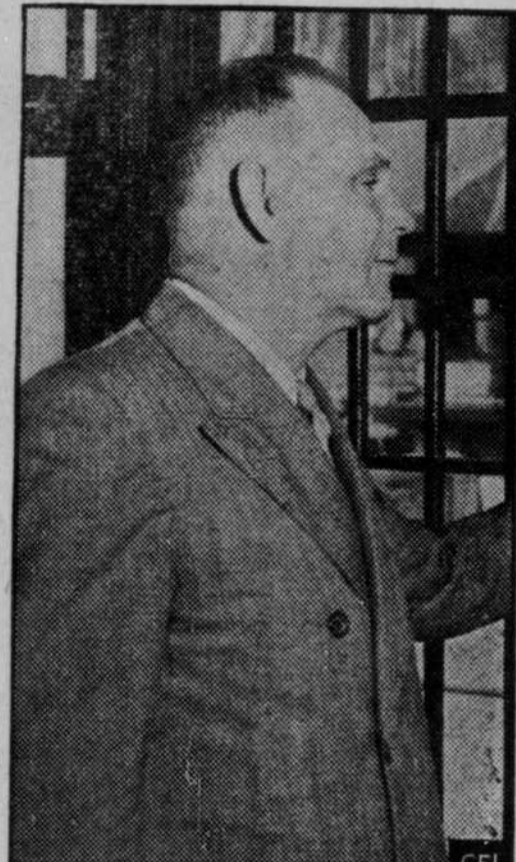
A NEW WARDEN COMES TO SING SING