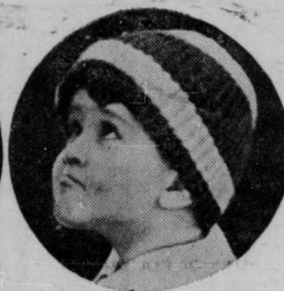
NO THERE AIN'T! (And who would argue against that determined jaw?)