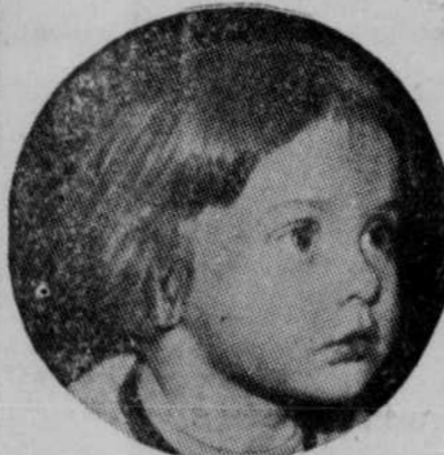
COURSE THERE IS! (And who could doubt those trust- ing eyes?)

Here Are Two Answers to That Important Question: