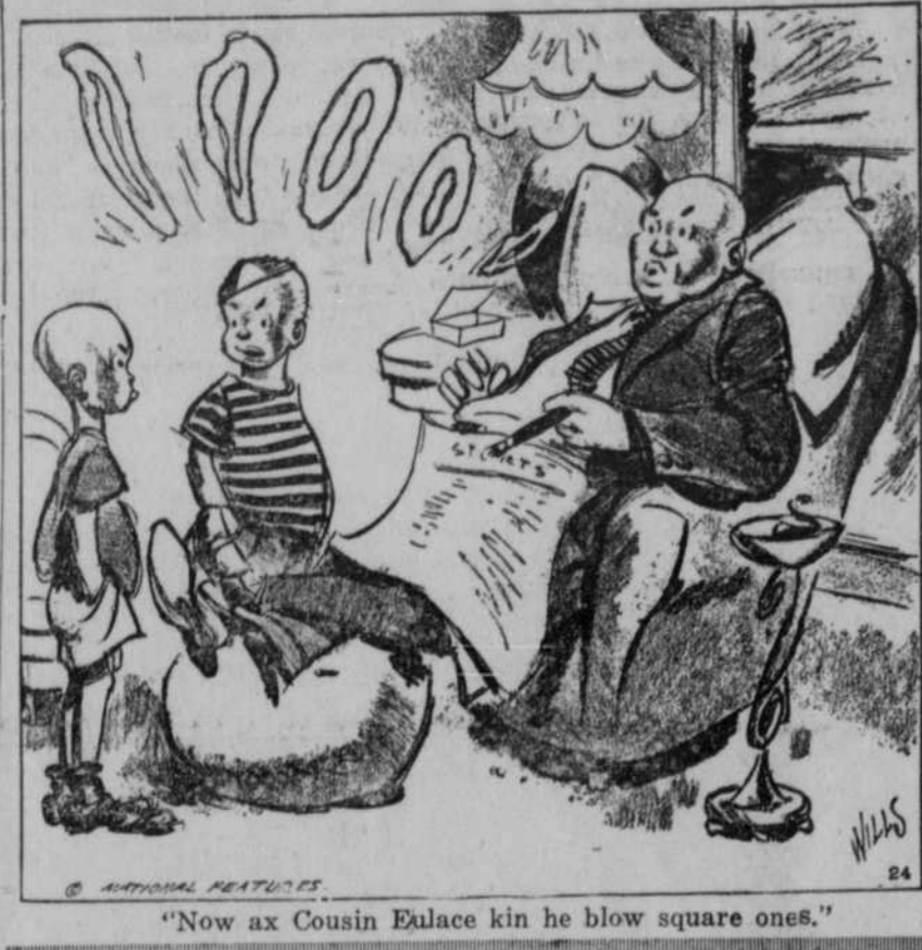
"Now ax Cousin Eulace kin he blow square ones."