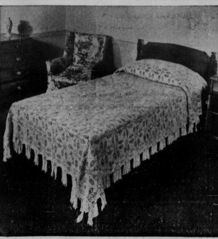
CROCHETED BEDSPREAD VESPERS #655

which according to one critic shows, tion just asked, I have put to my thers system of avoiding the charge tem. Let us hope that by the time that "his roots of art lie deeply race of people. It was prompted of not giving every group an op- the crypt is opened that those in within the great African tradition" by a news item from a California portunity to show its real worth that stage will have enough history The race is truly blessed in hav- paper which says that Jews double and intelligence. The book, Race at their command to realize how Grant St., Omaha Nebraska. ing within its group one of their themselves in population every ten Relations would serve a better pur- unfair their brethern of the presnumber who still retains his love years in that state and that they pose if it was placed in every librent age were in dealing with us in